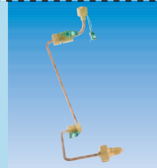
Ball-socket connections with adapter

Pigtailed and Ball-socket connections are used to connect cylinders to Valve boxes . Inlet connectors (cylinder side) vary according to the gas supplied.