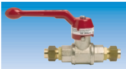
8 x 10 BS valve

Quarter-turn ball valve is used to isolate vacuum and medium pressure gas systems.