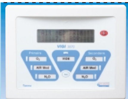
VIGI 3070 7 ways P/S