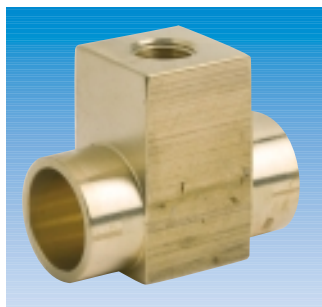
Adater 14 x 16 for analog vacuum sensor