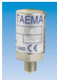
Sensor 0 - -900 mbar