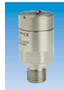
Sensor 0 - 250 bar