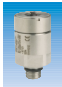
Sensor 0 - 16 bar