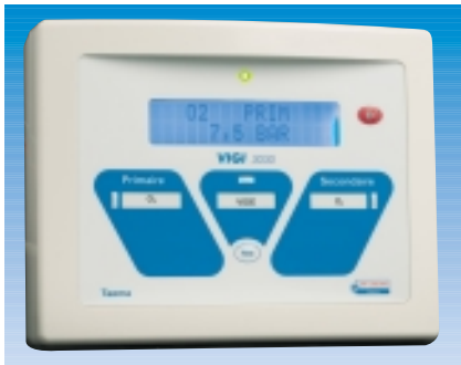
VIGI 3030 3 ways primary/secondary