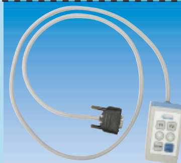
VIGI configuration keyboard