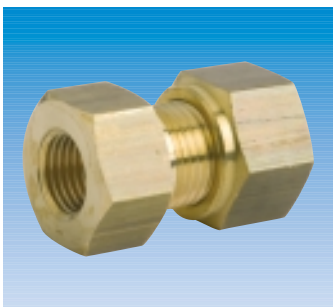
Adapter 1/4" gas female Ermeto